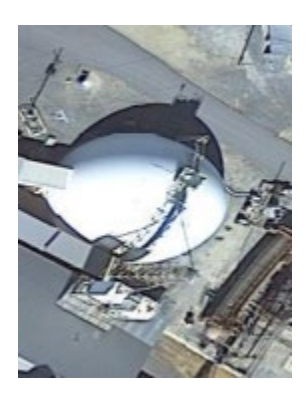
Ammonia Storage Tank