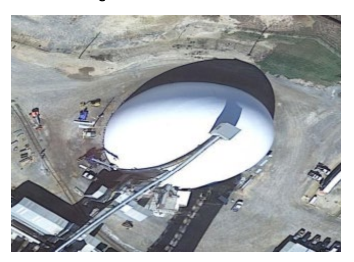
E-2 Plant Storage Dome